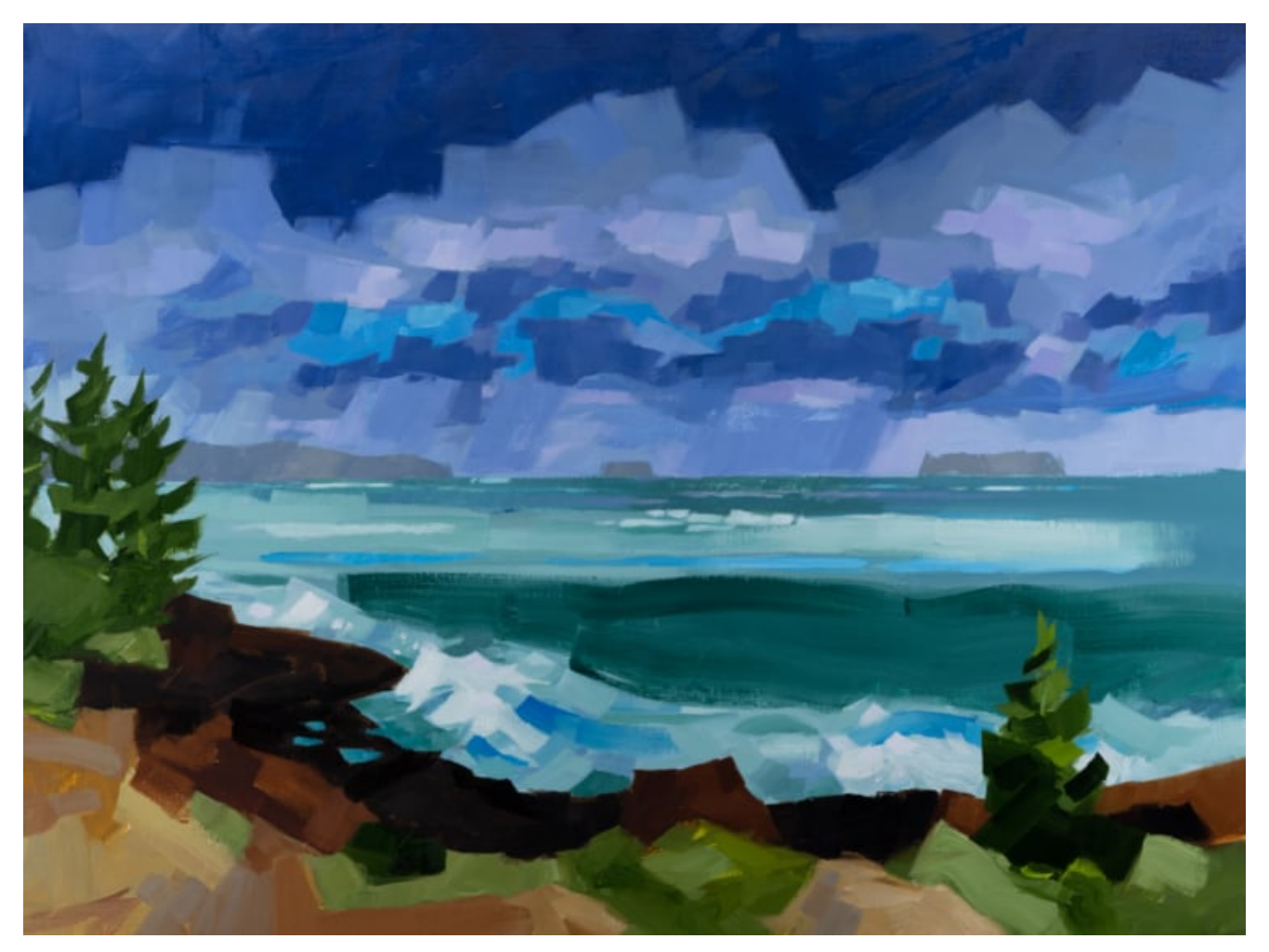
Philip Frey, "Lyrical Liquid," 2023

After a winter that felt unrelentingly gray and erratic (one day 53 degrees, another 7), some of us could use a reminder of why we live in the great state of Maine. Enter the biennial landscape show "Maine: The Painted State" at Greenhut Galleries (through May 27) and "Tree Speech" at Cove Street Arts (through May 13).