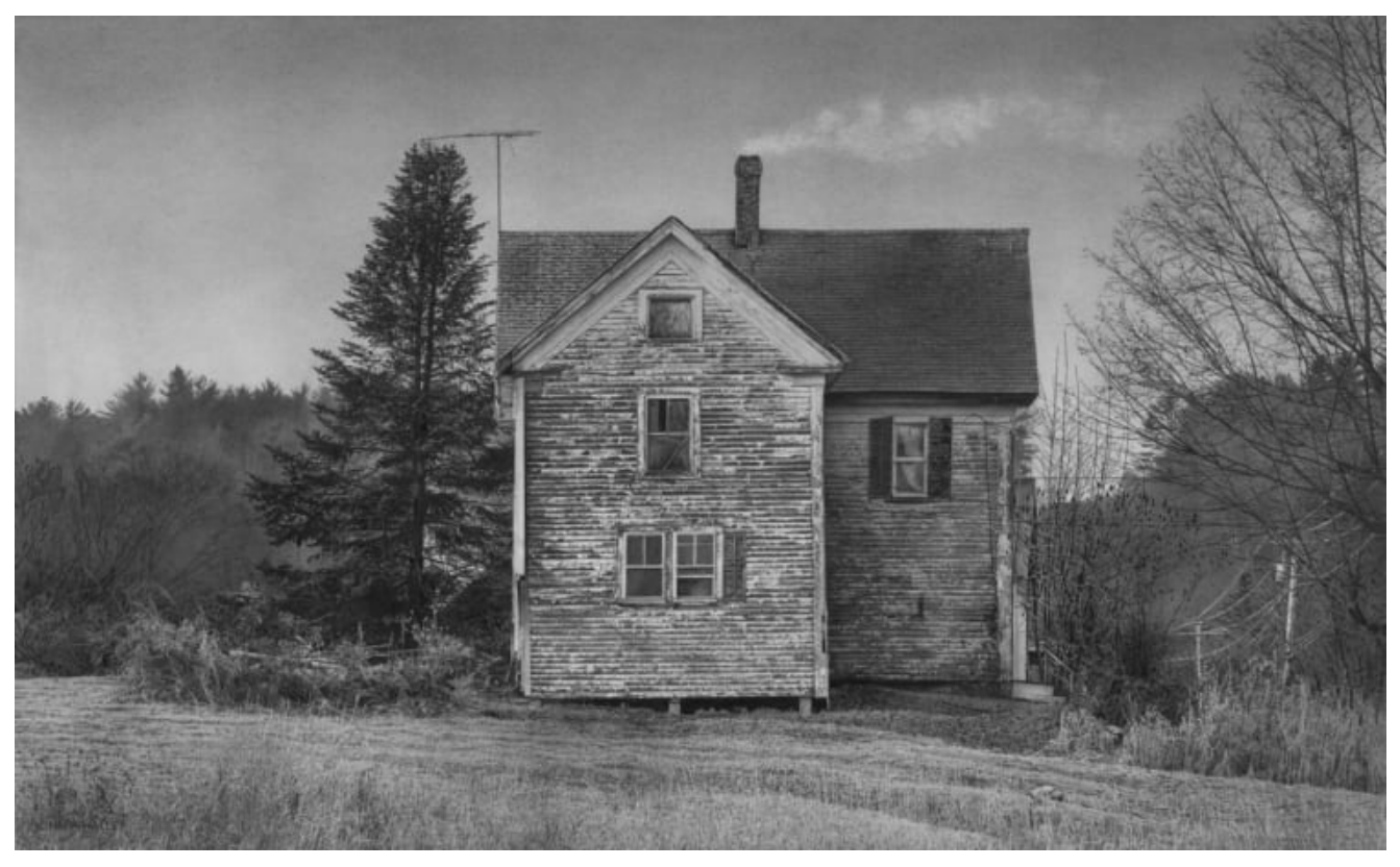
John Whalley, "House in the Mills," graphite on paper Courtesy of the artist

Two artists beautifully take on manmade structures in the landscape. The juxtaposition of Tina Ingraham's Bath bridge images, which share an almost identical perspective, give us two equally wonderful ways of looking at this architecture – one more loosely awash in pinks at what looks like dawn or dusk; the other in sky blues. And John Whalley's graphite on paper "House in the Mills" is, quite simply, a marvel of obsessive detail. It's practically photorealist, but achieved with such an intense observation that you'll want to look at it for hours.