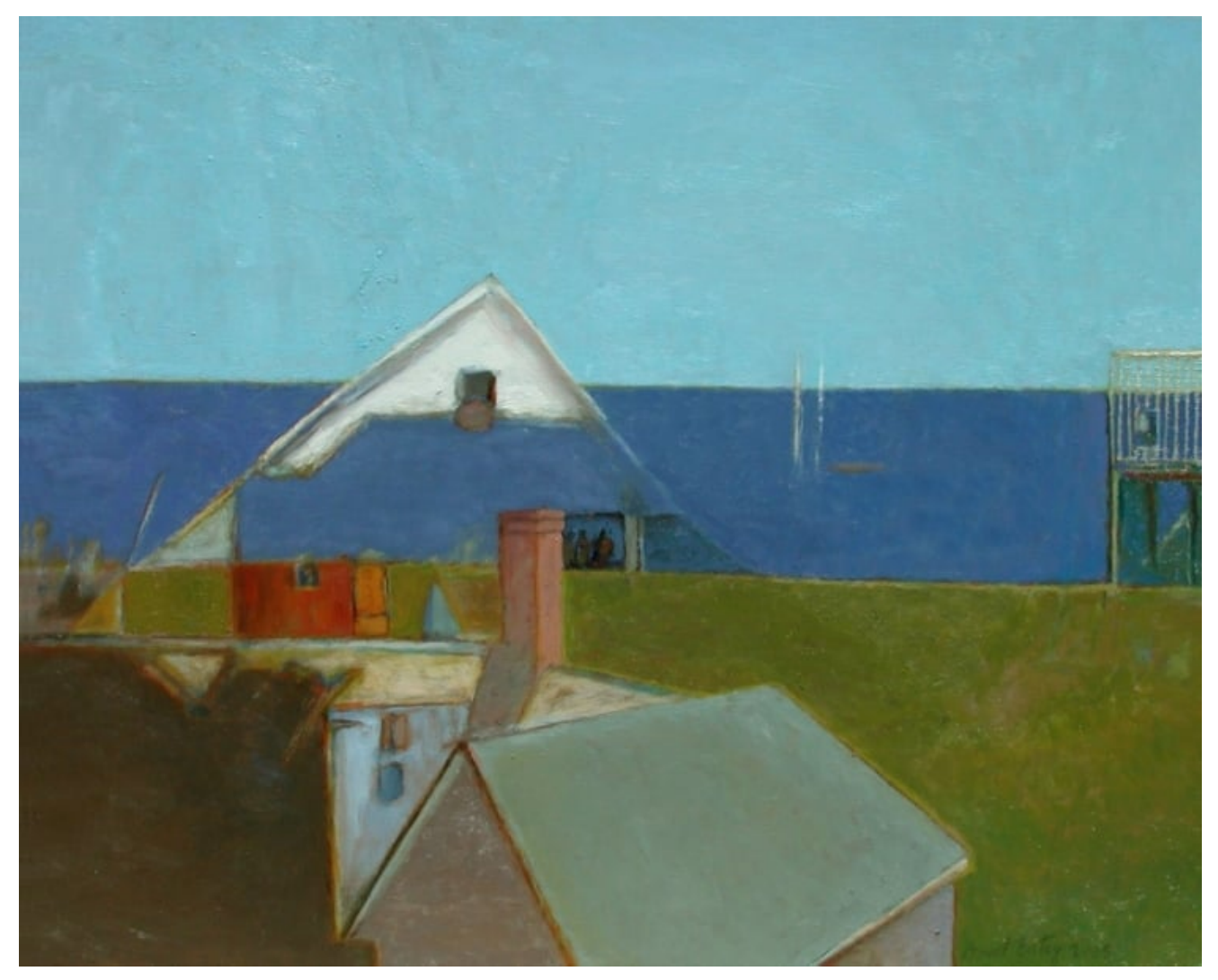
David Estey, "Harbor," 2005 Courtesy of the artist

One of the chief pleasures of the show is the variety of stylistic approaches artists have taken to capture something essential about the abundant natural magnificence of our state.